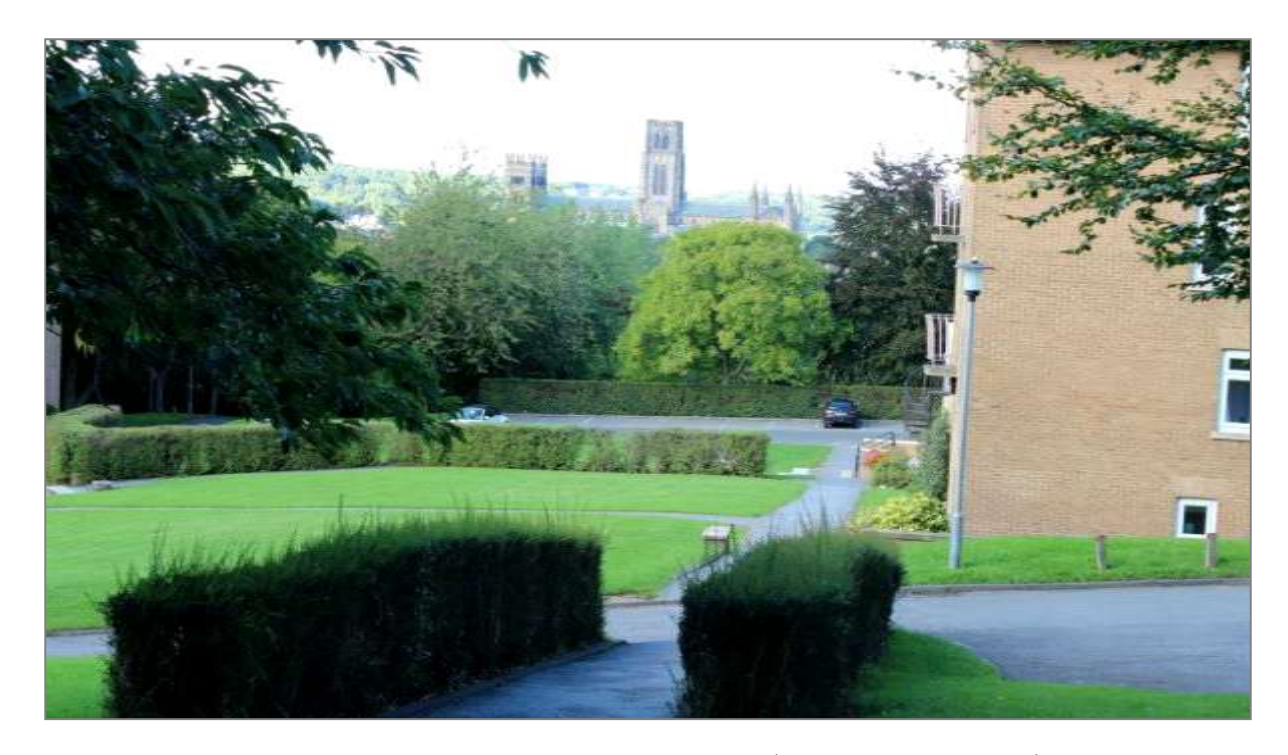
ABOVE : A peaceful afternoon at Grey College during Summer 2013