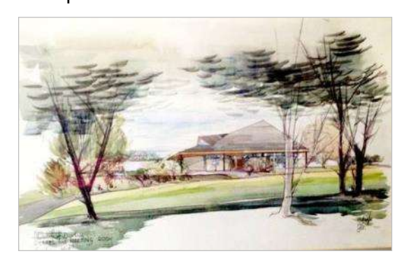
ABOVE AND RIGHT: Original Artists Impressions of Fountains Hall c. 1960

Between 2012 and 2015 Grey College Association has made an donations totalling £25,000 to the Grey Trust to support the development of Fountains hall.